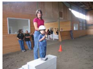
Where is he?

While riders and horses came from across the country to compete at the Twin Oaks Derby, children came for an exciting ride on an RTES therapist.