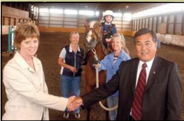
BOM Employees Fund donation