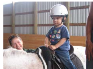
He's so big, but riding is great!