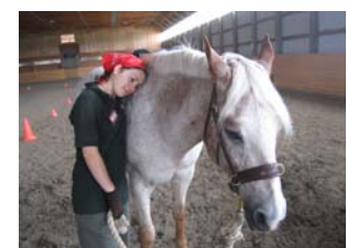
End of the day.