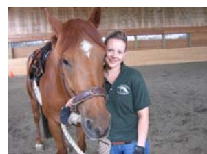
Some of the many volunteers-thanks for making it fun!