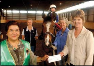
Richmond Chinatown Lions Club donation

It is with great respect and appreciation that we list our major supporters for the RTES program year 2006-2007. Your contributions made it possible for us to provide therapeutic riding classes to a number of children with disabilities in our area. These children and their families benefit greatly from this program—so on behalf of everyone associated with RTES we want to express our thanks to the following for their support.